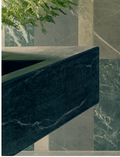
Wash basin: custom made of natural stone in the colour „nero creta"