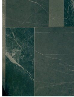
Wall material: Natural stone Casalgrande Padana Marmoker (grafite, verde aver, breccchia carsica)