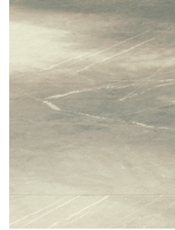
Floor material: Natural stone Casalgrande Padana Marmoker (grafite)