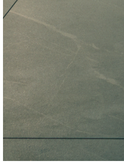
Floor material: Natural stone: Casalgrande Padana Marmoker (grafite)