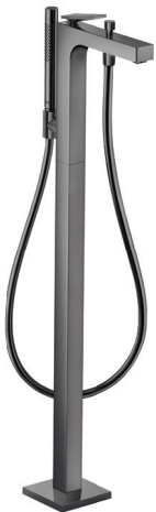
1 x Single lever bath mixer floor-standing with lever handle # 39440, -330