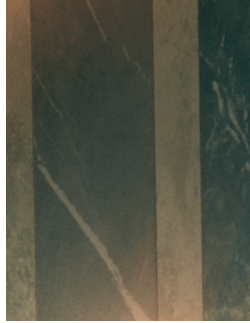
Wall material: Natural stone: Casalgrande Padana Marmoker (grafite, verde aver, breccchia carsica)