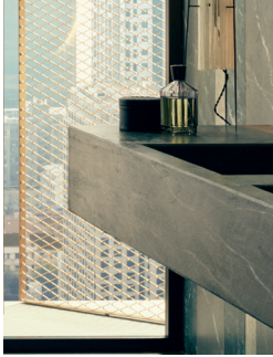
Wash basin: Custom made of natural stone in the colour „nero creta“